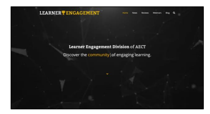
Learner Engagement <a href="http://learnerengagement.org">http://learnerengagement.org</a> <a href="Zephyr Theme">Zephyr Theme</a> <a href="No SSL certificate">No SSL certificate</a>

This website is well-designed and feels very professional. The use of the large image and teal/blue accents provides the viewer a feeling of trust and professionalism. However, the choice of image does not communicate the purpose of this group. The homepage presents a good balance of background information, announcements and social media connections. Finally, the simple navigation on top provides the user with easy access to all relevant content.